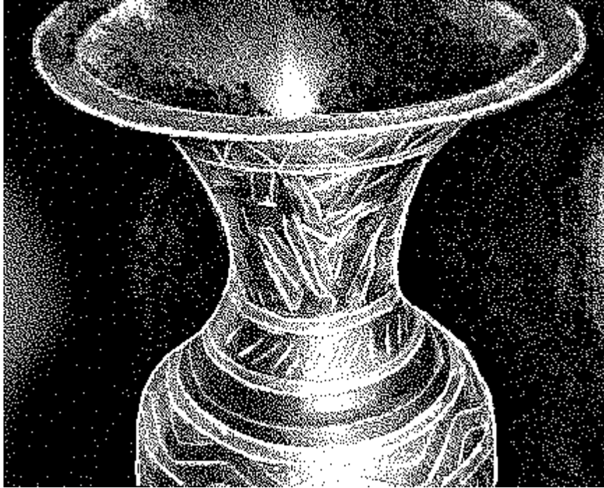
Egyptian vase with Egyptian dust

When I opened the large package that came all the way from Cairo, Egypt, I was amused to find Egyptian dust on the shapely brass vase. I fingered it, thinking of the desert lands there, and how our word for 'desert' must surely have derived from theirs, dshrt , or 'red land'.